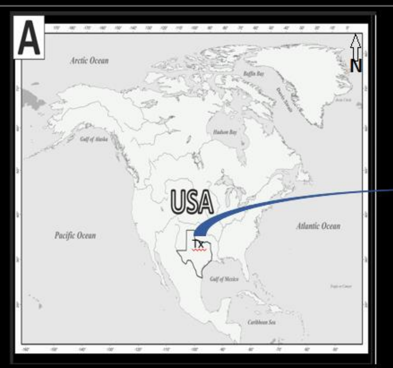
Figure 1. A) Map of USA and Texas (Tx). B) Type locality (Honeycut Spring).

Over the last decade, studies on freshwater ostracods of Texas have been releasing interesting results which clearly portrayed unique and high species diversity in the state (Külköylüoğlu et al. 2021, Külköylüoğlu and Tuncer 2022, Külköylüoğlu et al. in review). These studies, in total, revealed about 117 freshwater ostracods. This number is about 25% to 33% of the species in the country (Külköylüoğlu, pers. obs.). Moreover, this number is also found relatively high compared to many other countries in the world such as Turkey (160 spp.) (Külköylüoğlu pers. obs.), Italy (156 spp.) Pieri et al. (2015, 2020), China (154 spp.) (Yu et al. 2009), India (152 spp.) (Karuthapandi et al. 2014), and Germany (126 spp.) (Frenzel & Viehberg 2005). Hence, considering the areas and habitats not sampled and/or not studied yet, the state of Texas represents much higher species diversity. Indeed, contemporary studies in different taxonomic groups (Gibert et al. 1990, Hall et al. 2004; Segers 2008, Hutchins et al. 2020, Gibson et al. 2021) also support this view along with potentially high species diversity of the area. Such richness and high diversity is not only found in the epigean aquatic habitats but also in the subterranean and ground water habitats. The aim of this study is to introduce a new genus in the family Candonidae from Honeycut Spring, Texas, USA.